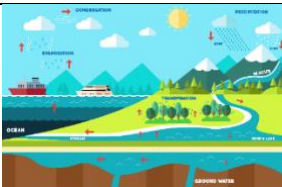
The water cycle