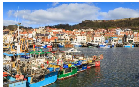
Scarborough - the coastal town

Charles Waterton - explorer and one of the first conservationists.