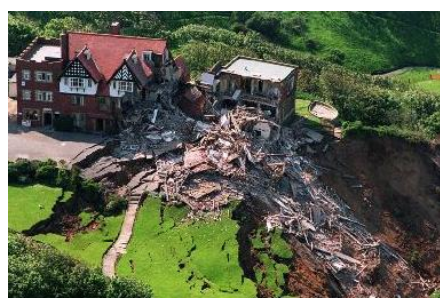
Holbeck hotel - Scarborough